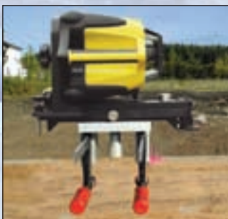
RUGBY 200 with mounting bracket used on a batter board