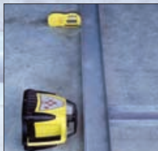
RUGBY 200 with Rod-Eye Pro in a lay-down position